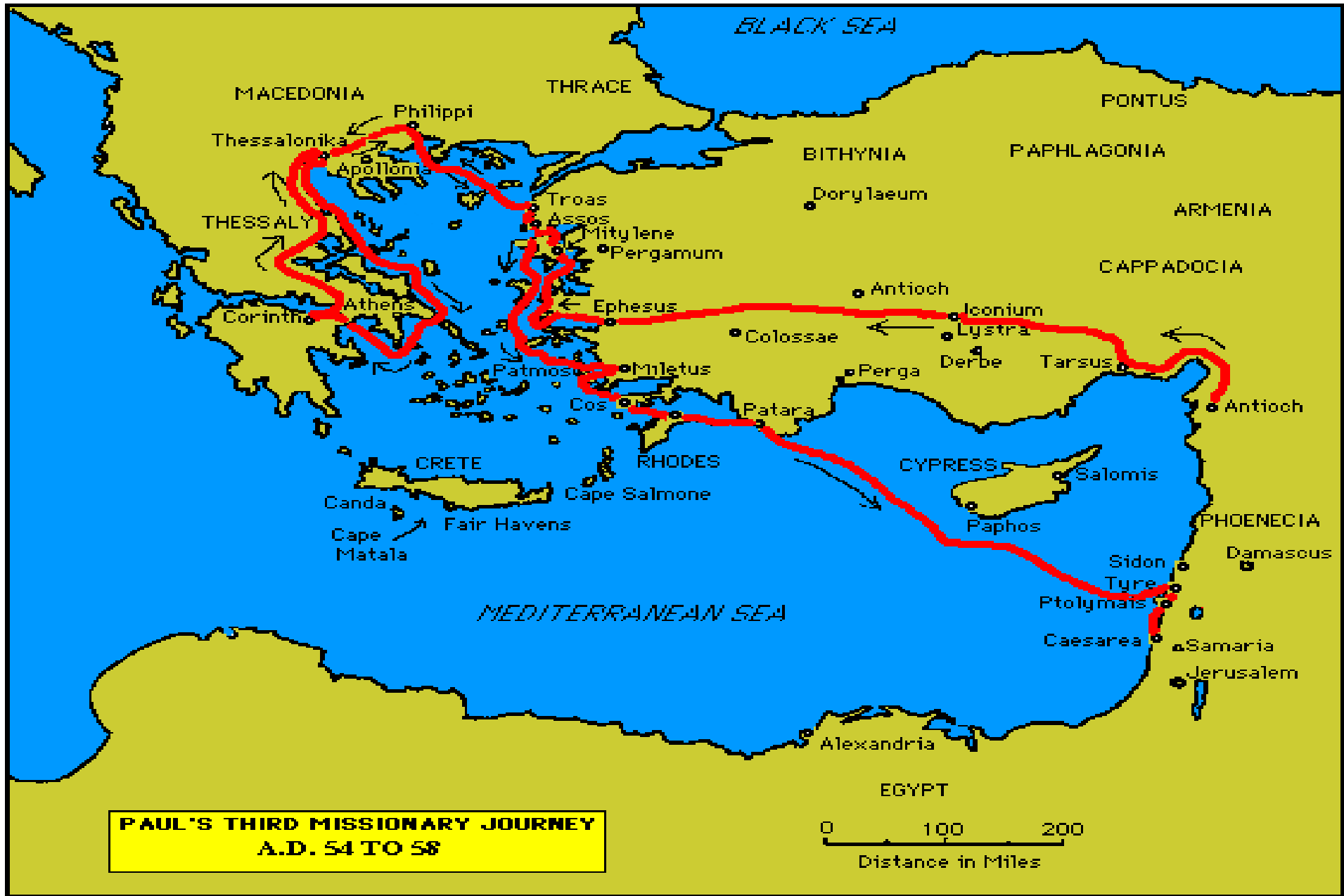
PAUL'S THIRD MISSIONARY JOURNEY A.D. 54 TO 58